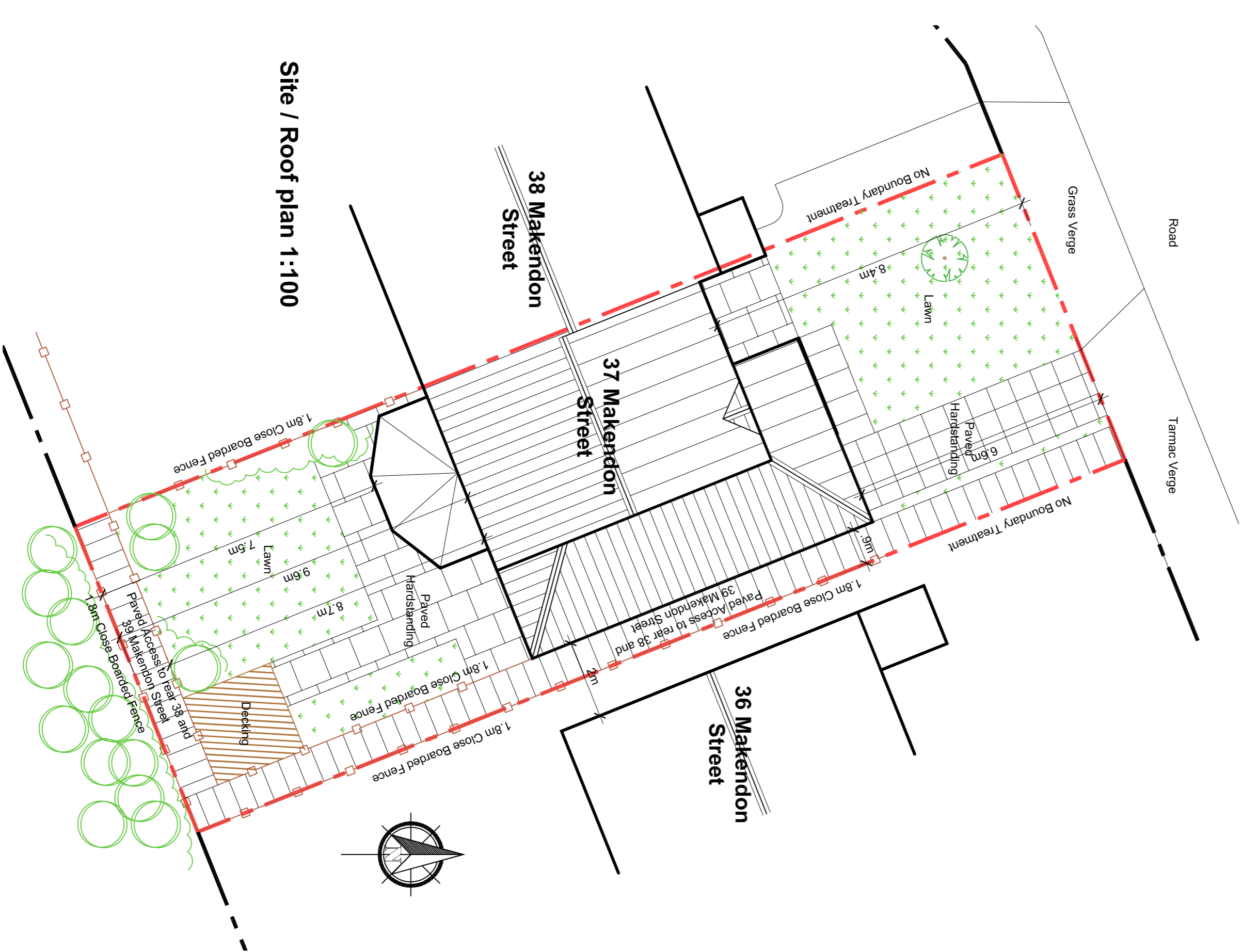
Site / Roof plan 1:100